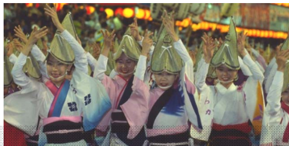
Awaodori Dance Festival