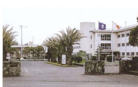
Anan National College of Technology